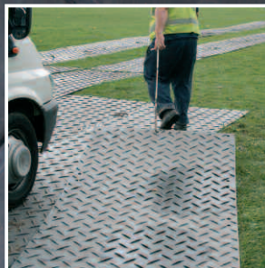
Handy-Hook for easily moving panels