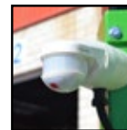
Overview of motion detector for outdoor use