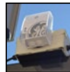
Light sensitive switch