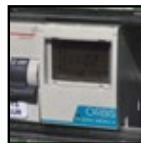
Digital Time Switch 220V