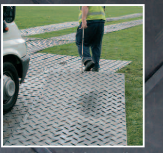
Handy-Hook for easily moving panels